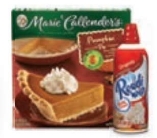
Marie Callender's Pies: select varieties 28 to 46 oz. $6.48

Reddi Wip: select varieties 6.5 oz. $2.28