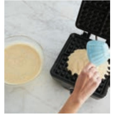
STEP 9: Add batter to preheated waffle maker. Close lid immediately and bake according to manufacturer's directions. When done, use a fork to lift waffle off grid. Repeat with remaining batter.