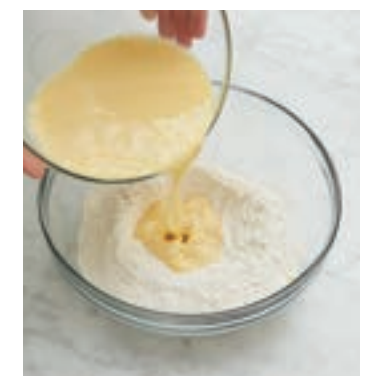
STEP 7: Add egg yolk mixture all at once to the flour mixture. Stir just until moistened. The batter will be slightly lumpy.