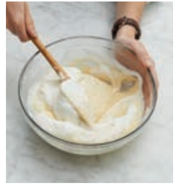
STEP 8: Gently fold beaten whites evenly into mixture.