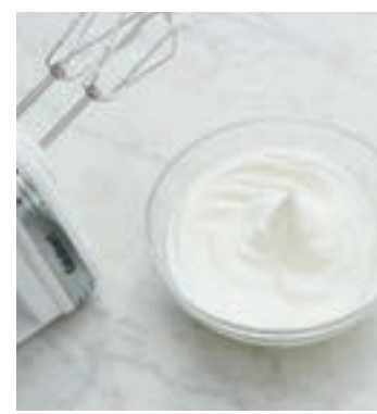
STEP 6: Beat egg whites with an electric mixer on medium to high until stiff peaks form (tips stand straight). Set aside.