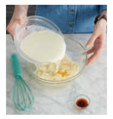
STEP 4: In bowl with egg yolks, add buttermilk and vanilla.

STEP 3: In a large bowl, stir together flour, malted milk powder, cornmeal, baking powder, baking soda and salt. Make a well in the center of the flour mixture. Set aside.