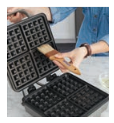
STEP 1: Lightly grease and preheat a waffle maker according to manufacturer's directions. Use a regular or Belgian waffle maker.