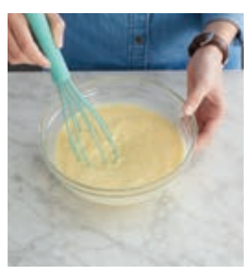
STEP 5: Whisk mixture together to combine well. Set aside.