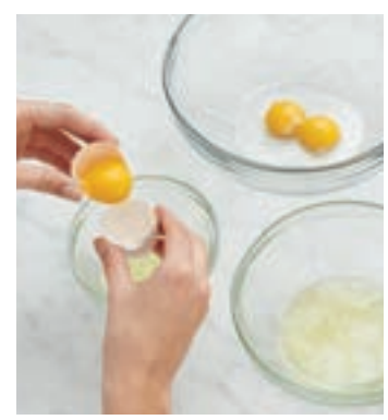
STEP 2: Separate the eggs. Place yolks in a medium bowl and whites in a small mixing bowl; set aside.